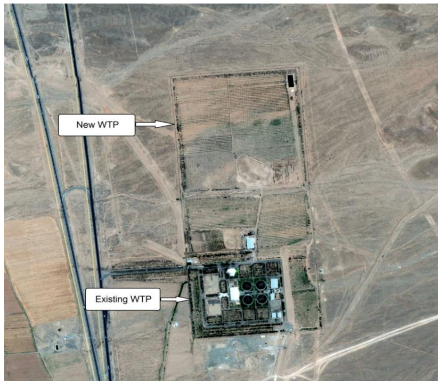
Figure 2. Picture of Qom Water Treatment Plant (2)