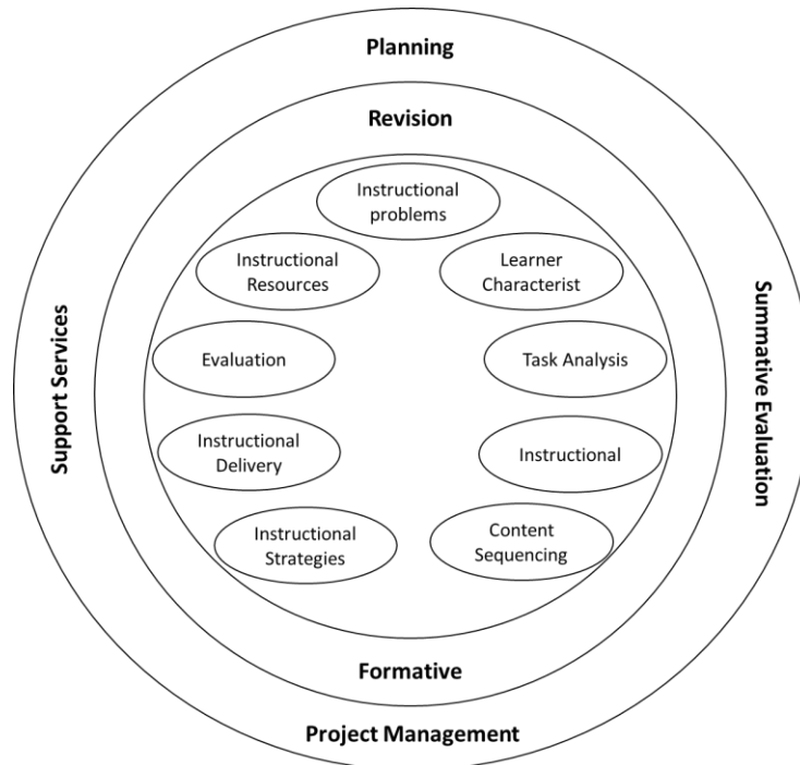
Figure 1. The Development Cycle of the Kemp Model Device (Kemp, et al, 1994)

The development of inquiry-based teaching materials in this study adapts Kemp's (1994) model. In general, Kemp's teaching materials development model is shown in Figure 1.