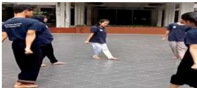
Figure 10. Maena Fangowai Dance