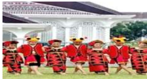
Figure 14. Dance No Tatema Mbola

The No Tatema Mbola dance is a creative dance that has become part of the identity of the Nias people, which symbolizes cohesiveness, togetherness in society. This dance can be danced by both male and female dancers where the movements between male and female dancers have the same thing only that is different in the clothes worn in this dance by using external music.