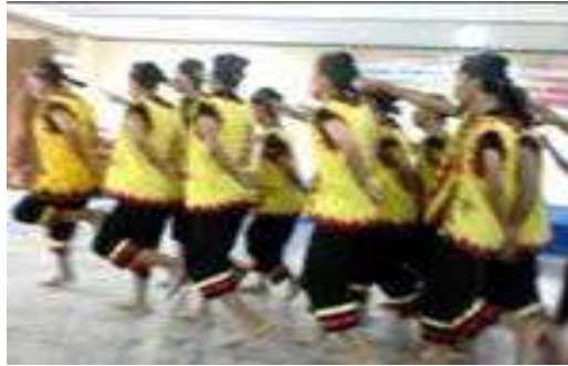
Figure 5. Famadögö Omo. Dance