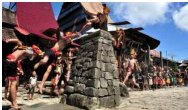
Figure 9. Hombo Batu Dance

When the youths succeed in jumping over Hombo Batu, it is considered that the youth has passed the selection and will go through the process of training for war before finally becoming a soldier. When the youths who have been selected as soldiers, Si'Ulu will hold a village party and will announce the names of the youths who have passed Hombo Batu and will form the Fatele army.