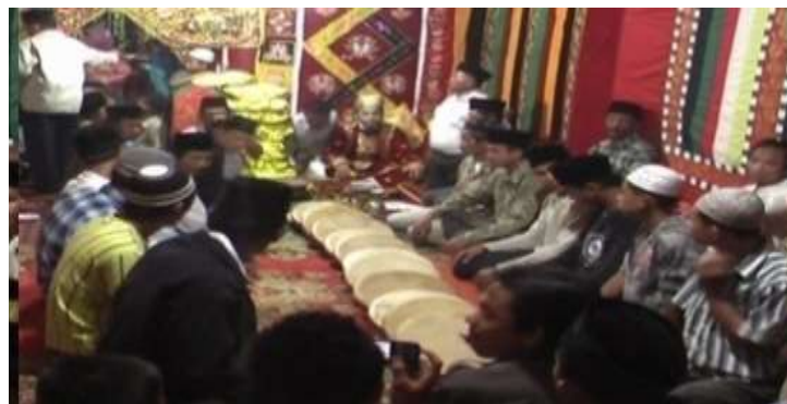
Figure 11. Mahanggu Dance

The Mahanggu Dance was originally a dance that was used as a medium or tool for spreading one religion, namely Islam in North Nias. Then at this time the Mahanggu dance is more popular and developing among the community such as traditional art performances, wedding parties, to the stage of other large events that are not far from the needs of the community itself.