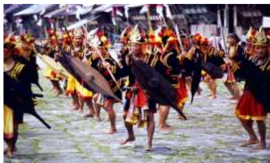
Figure 7. Fatele Dance

Fatele dance is one of the famous war dances from South Nias. In the past in Nias village, there were often wars over land. So that Si'Ulu (leaders/high-ranking officers of Nias village) had the idea of gathering young people to practice war who would be selected first by the Hombo Batu method. The goal is to practice war in order to defend the village from enemy attacks.