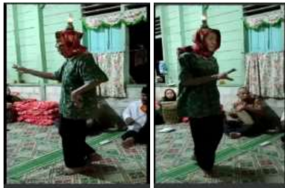
Figure 8. Giri-giri Dance

The properties used in this dance are wadru (lamp), gala gahe (leg bracelet) and lembe (shawl) of Minang custom. This dance uses a lot of hand movements that are swung very gracefully and leg movements jump. This dance used to be performed on comedy shows commonly called "kemidi". This kemidi event is an art event for the people of North Nias, now the people of North Nias have made the dance one of the performances at weddings.