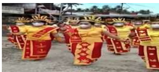
Figure 12. Mogaele Dance

Mogaele This is a dance that is danced by a group of girls who are offering betel nut to guests who want to visit. This is very important because the guests who are welcomed are guests who play an important role such as government employees, ministers, and other officials who voluntarily visit the island of Nias. Especially in south nias, while in north nias this dance is also called the Famaola gö afo dance. This dance is danced by a beautiful girl who is very polite and friendly until it is known that Nias girls are part of a good personality, have a high socialization spirit, are able to interact with others.