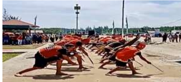
Figure 3. Boliba. Dance

on the way from one village to another to the event house (the party organizer). The visitor will walk into a village and meet the host's representative as an initial welcome and as a guide for visitors to the host's house. Based on this, so that it can be concluded that this dance depicts a very friendly relationship with visitors who want to stay in touch and establish good relations with one another in order to prioritize the good intentions achieved.