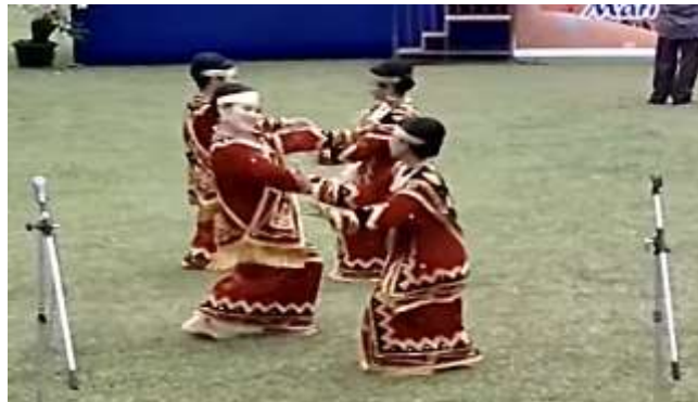
Figure 13. Moyo Dance

persistence and diligence of the Nias people in trying, being independent, and not lazy. So that this dance really inspires the people of Nias and can be performed before and after the event or celebration being held.