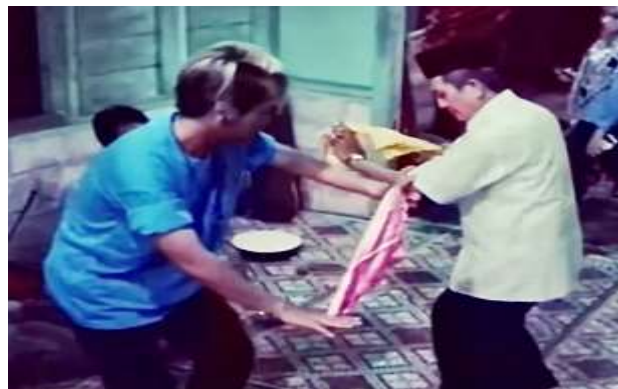
Figure 4. Book Dance

Book Dance is a Nias dance originating from the northern part of Lahewa, North Nias Regency. The Buku Dance in this dance is symbolized by "a woman" which means that the honor of a woman must be maintained, in the Nias language the word Buku means bowing, so the Nias people call this dance the "Book Dance" because at that time the dance was performed with the body having to bend, because in the view of the North Nias Muslim community that bowing is a form of respect and courtesy to fellow citizens. This dance is a traditional dance performed at the Mamedadaö night event as one of the arts in the North Nias community. This dance has existed and was created since ancient times by ancestors brought by immigrants from Minangkabau so that the culture has been assimilated to those who came to Nias.