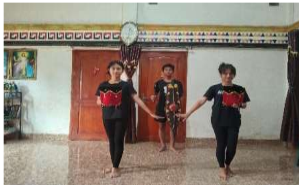
Figure 6. Dance of Fame' Afo

This dance is usually danced by an even number of women, namely between 6 or 8 dancers, 4 men, and accompanied by 5 musicians according to traditional Nias musical instruments. And sometimes it also has a poet but it is adapted to the situation and conditions. This dance is usually performed wearing Nias ornate dance clothes (red, yellow and black). For the design itself, at present, many Nias dance outfits have been created to suit the needs of each event. The existence of the Fame Afo Dance creates interaction between people as part of the identity of the Nias people.