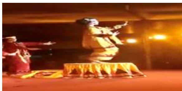
Figure 15. Tuwu dance

Initially Tuwu Dance appeared when a queen named Barasi Balugu performed a simple movement while saying a word, namely tuwu with the aim of encouraging people who were working to find the great stone which has the goal that the queen encourages people to work to find the stone of majesty. Currently Tuwu Dance is danced by very beautiful female dancers and is accompanied by various traditional Nias music as a welcome guest at a traditional Nias event. Until now, Tuwu dance is presented with an attractive appearance in cultural parties, welcoming guests both visiting and other spectators. The movement in this dance is an imitative movement of people who are working with feelings of happiness and enthusiasm.