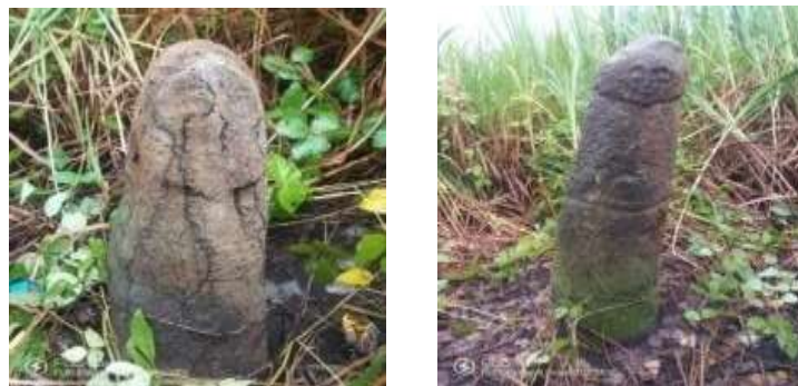
Figure 18. Stone monolith presenting mother (Monajuk).

Silk cotton tree fell as a result of burn-in Nnam Open Air Museum with monolith around it