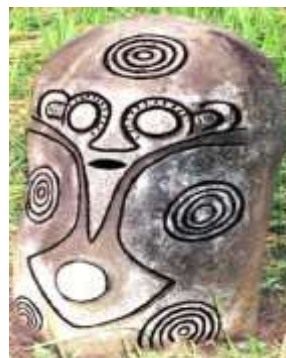
Figure 7. Akpanyan (a talking stone)

The inscription of the stone shows a peace sign. This is used when two communities fight and decide to make peace after a tribal war. It has a latitude of 06^{\circ} 19' 43.1'' and longitude 008^{\circ} 39' 07.7'' with the height of 60cm and 117 m as elevation, a distance of 5.60.