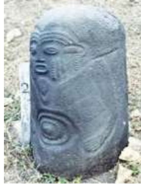
Figure 8. Stone monolith representing a visionary

The stone has nsibidi sign meaning a woman who is mourning because she lose her husband. It has latitude of 06^{\circ} 19' 42.1'' and longitude 008^{\circ} 39' 08. 0'' with height of 85cm and 123m as elevation, distance of 6.73.