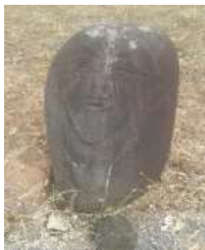
Figure 13. The stone monolith represents the female vision of Ekpe secret society

Warriors are always carved with volcanic rock, they are defaced with whitish color and lose surface inscription. It has a latitude of 06^{\circ}19' 41.6'' and longitude 008^{\circ} 39' 08.1'' with a height of 102cm, elevation 123 and has a distance of 5.34. And the second one has a latitude of 06^{\circ}19' 42.1'' and longitude 008^{\circ} 39' 07.1'' with a height of 85cm, elevation 118 and has a distance of 8.57.