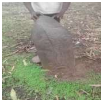
Figure 15. Stone monolith representing a king stone

It has a two-star inscription which means, the man that has the ability to see into the future, a visionary is one who can envision the future. Divination can be seen as a systematic method with which to organize what appear to be disjointed, random facets of existence such that they provide insight into a problem at hand. For some groups, this can involve the supernatural. It has a latitude of 06^{\circ}19' 41.2'' and longitude 008^{\circ} 39' 07.3'' with a height of 80cm, the elevation of 125m and has a distance of 8.54.