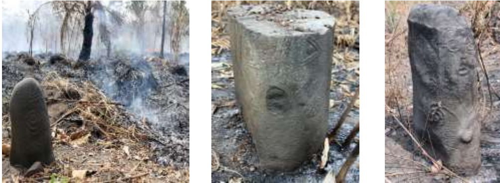
Figure 17. All of the stone monoliths are under the threat of bush burning

Children gather and play around the stone scarifies are made to the stone before the celebration of the new yam festival. It is used by tourism bureaux as their logo. It has clockwise and anti-clockwise, the stone is painted with green, red, blue, white, and yellow it has a latitude of 06^{\circ} 19'107'' and longitude 008^{\circ}38'53.4'' , it is 94cm in height, 141m in elevation, and has a distance of 1.8ft apart.