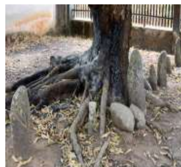
Figure 16. Stone monolith representing children.