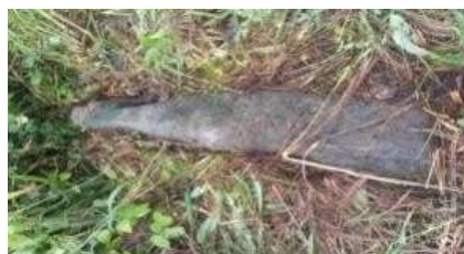
Figure 19. Stone monolith representing security (Nkumm)

Representing the mother of the clan who the other lineage comes, they are of the belief that the stone represents who gave birth to them.