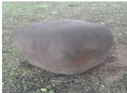
Figure 6. Peace stone monolith

It is a paramount stone where rituals are been carried out on stone to appease the ancestor before the new yam festivals. The stone has a triangular sign on it, there are four triangle squares, and the two triangular squares are the former despite the four age groups in the community. The two triangle squares represent the two groups of warriors who carry elephant tusk Arobe and Nkpanyang It has a latitude of 06^{\circ} 19' 42.3'' and longitude 008^{\circ} 39' 07.9'' with a height of 43cm and 117m as elevation, a distance of 5.57.