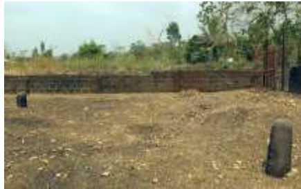
Figure 2. Emangabe Open-air museum