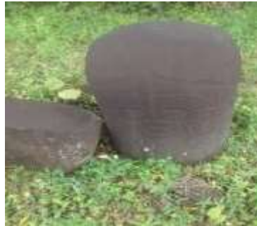
Figure 14. Stone monolith representing a visionary.

It always comes out in the night. It is believed that any man who sees them will die. It has a latitude of 06^{\circ}19' 41.8'' and longitude 008^{\circ} 39' 07. 0'' with a height of 80cm, elevation 120m and has a distance of 8.97.