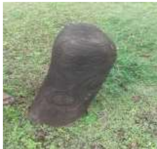
Figure 9. Couple Stone Monolith.

The stone has nsibidi sign meaning a woman who is mourning because she lose her husband. It has latitude of 06^{\circ} 19' 42.1'' and longitude 008^{\circ} 39' 08. 0'' with height of 85cm and 123m as elevation, distance of 6.73.