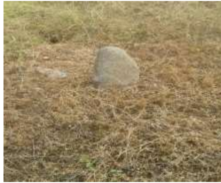
Figure 5. The Paramount Stone Monolith

It is a paramount stone where rituals are been carried out on stone to appease the ancestor before the new yam festivals. The stone has a triangular sign on it, there are four triangle squares, and the two triangular squares are the former despite the four age groups in the community. The two triangle squares represent the two groups of warriors who carry elephant tusk Arobe and Nkpanyang It has a latitude of 06^{\circ} 19' 42.3'' and longitude 008^{\circ} 39' 07.9'' with a height of 43cm and 117m as elevation, a distance of 5.57.