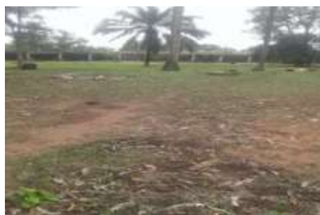
Figure 4. Alok Open Air Museum