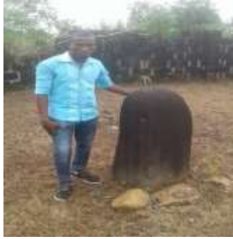
Figure 11. The researcher with a stone monolith (Ntulenmang).

It represents the Ntulenmang. The first Ntulenmang was mgbe Abang Mbua, the Ntulenmang is the current paramount ruler of Ikom Local Government Area. It has a latitude of 06^{\circ}19' 41.5'' and longitude 008^{\circ} 39' 07.2'' with a height of 120cm, an elevation of 120 and has a distance of 5.54.