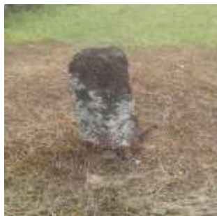
Figure 12. Stone monolith representing warriors

The arrangement of stone in Emangebe stone circles is of significant importance to engineering and astronomers it shows that the builders were skillful in craftsmanship in the way the stone was arranged to give the circular shape as shown above. This somehow shows or supports the assumption of professor “Thom (1978) megalithic remain in Britain and Britany Clerando” that stone circles were used for calendrical reckoning, and the uses of the stones for counting market have had some level of cosmological consciousness and well skillful in astronomic and geometry.