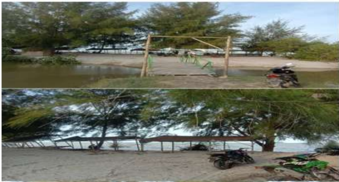
Figure 2. Mangrove Condition of Pari City Village, Mirror Beach

A condition that often occurs is the dependence of local people's lives on mangrove forests as their source of livelihood. Related to the description above, local community activities will eventually utilize mangrove forests in an environmentally unfriendly manner and the impact is that mangrove forests will be degraded and damaged, even these natural resources will become extinct. Actually, the local community already knows about the role and benefits of mangrove forests on their environment, but they have no other choice because to maintain their lives with their families, they must use the forest, so the damage to mangrove forests that occur in Pari City Village, Pantai Cermin District is quite a lot.